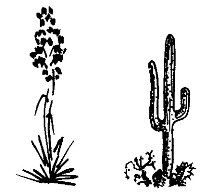
A new idea for your family vacation--